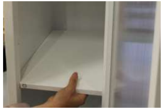
Pic > B