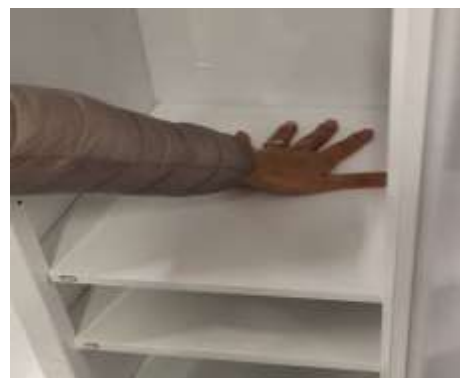
Pic > D