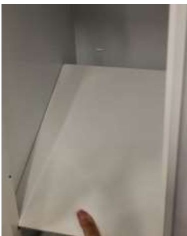
Pic > C